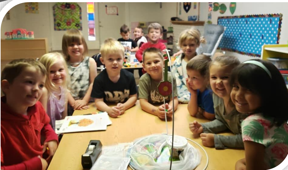
Preschool and PreK watched as the caterpillars became butterflies!